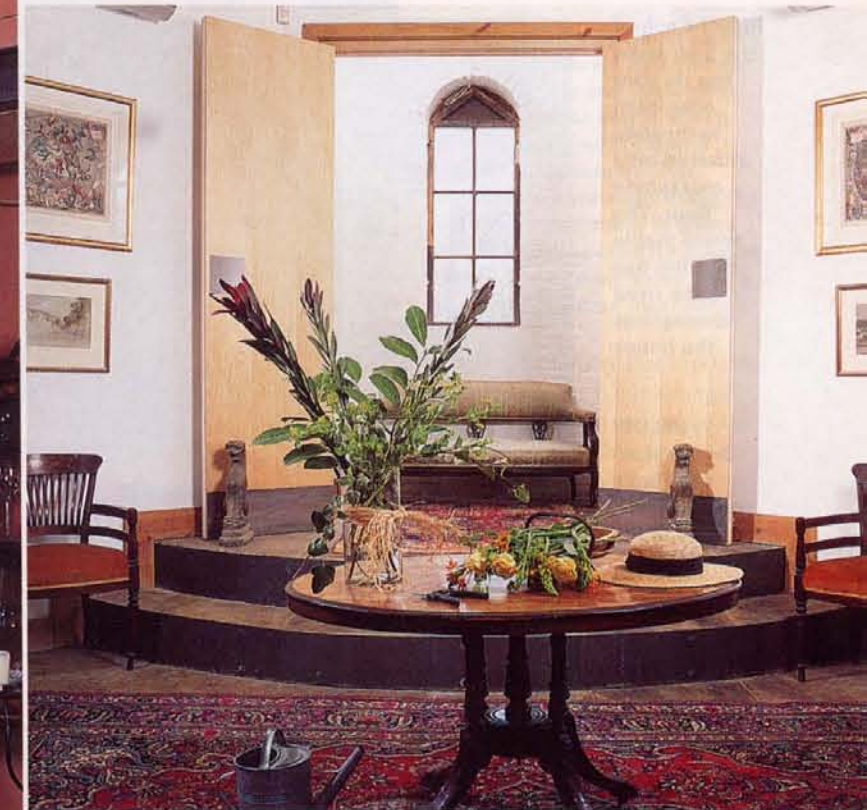
ABOVE The ground floor, with its two sets of magnificent custom-made double doors, acts as reception hall. An oriental rug softens the Belgian stone floor which leads, up two steps, to the staircase

steel beams to support the floors and staircase cost another £25,000. With such an unusual building, it isn't possible to buy standard fittings, and everything had to be custom-made - the doors, for example, are three metres high. Elspeth built the maple staircase, which runs around the octagonal walls, on to the basic steel structure, securing each tread with four brass bolts. She ▶