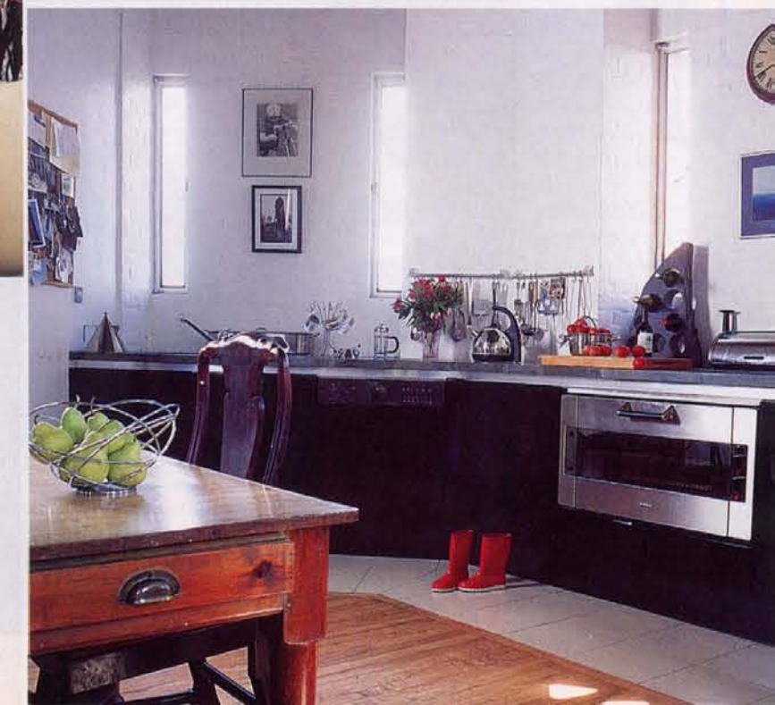
BELOW Like everything else in the house, the kitchen was designed by Elspeth. Polished Cumbrian slate worktops, with sink and disposal unit, occupy three sides of the room. The big square table and the railway station waiting-room clock are family treasures